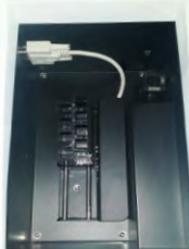
Big Sample Room