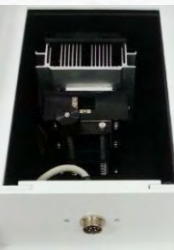
PELTIER SAMPLE HOLDER